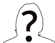
Still looking for him/her